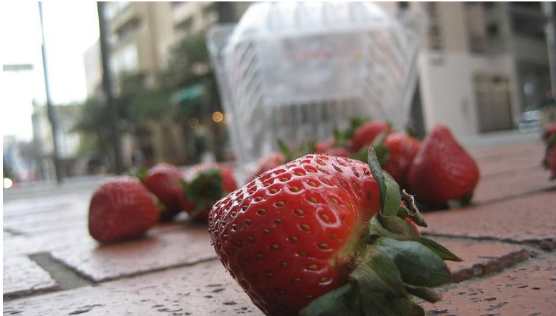
Strawberries spilled out of their container on the sidewalk.

In the 1500s, Copernicus flipped over long-standing beliefs in the science world. He pointed out that the Earth revolved around the sun instead of the other way around. Today, scientists are flipping over another ancient belief system. It is the belief system surrounding a dropped slice of pepperoni pizza.